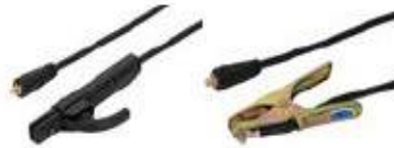
Electrode holder And cable